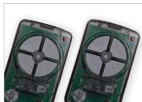
Two TrioCode™128 transmitters