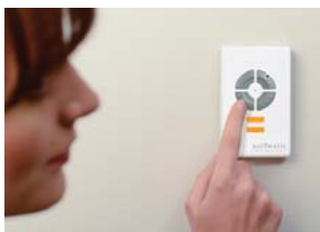
Wall mounted TrioCode™128 control panel