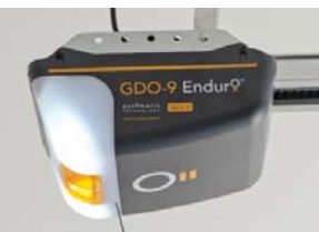
Opener with LED Courtesy Lights